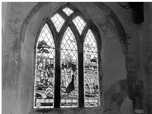
“Ramblers Church” window Walesby, Lincolnshire